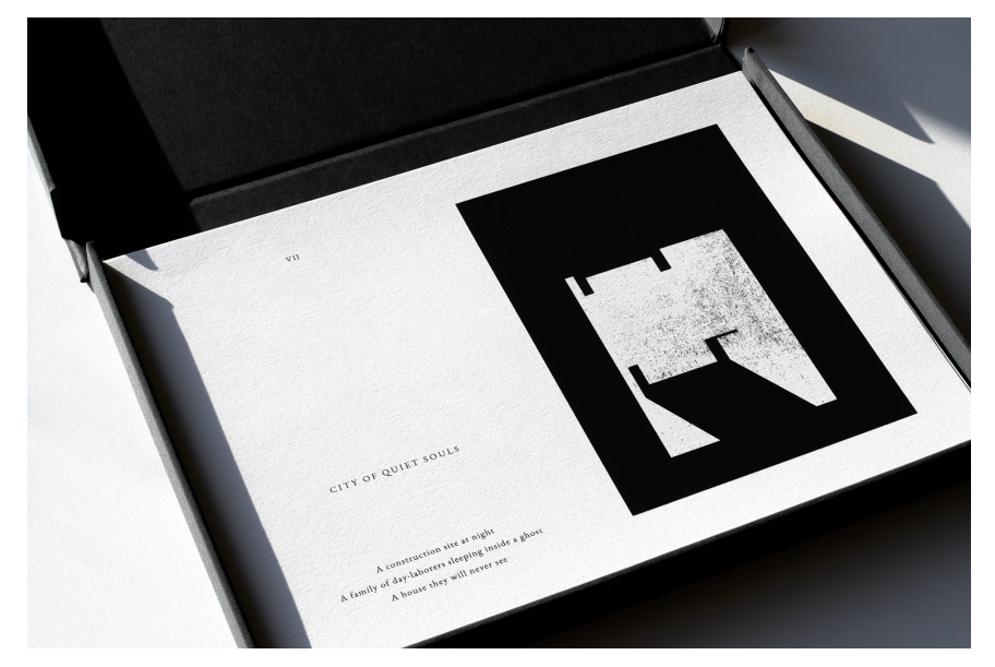
Seher Shah, Notes from a City Unknown (detail), 2021

Seher Shah's Notes from a City Unknown is a portfolio of thirty-two screen-prints on paper, drawing on observations and reflections from New Delhi. Through poetic notations composed alongside architectural forms, the work explores the city through sites of fissure, complexity and contradiction. Shah looks to bind architectural, political and historical events, to the intimate and personal. Written between 2014 and 2021, the work is set against a backdrop of a brutal nationalism, pervasive surveillance and the mass mobilization of minority communities for their right to home and citizenship. At the core of her work is a question of home and belonging through the traces of those that came before her.