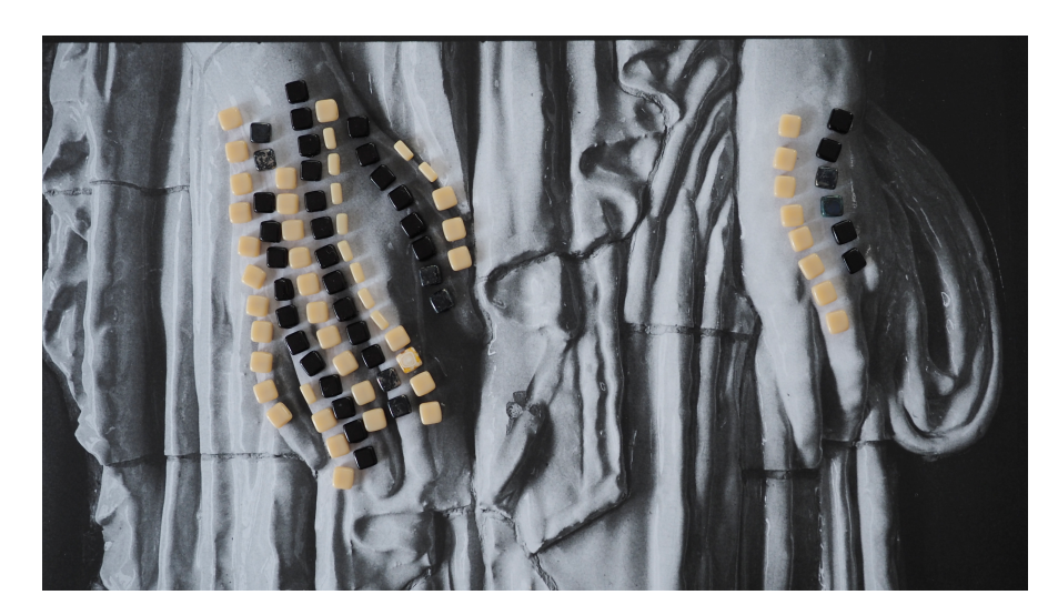
Hera Büyüktaşciyan, The Labyrinth of the World, Paradise of the Heart (video still), 2021-22

In her film, The Labyrinth of the World, Paradise of the Heart (2021-2022), Hera Büyüktaşcıyan anchors the surface and underground through the water architecture of Prague, a city that is often referred to as a threshold. Using stop motion sequences, glass beads meander through the cavities of wastewater treatment plants and public baths covered with glazed Rako tiles. These ornamental tiles resurface an underlying tension between the body and the constructed environment in relation to the city's colonial past that shaped notions of purity and cultural contamination. The title of the film references the allegorical work of Czech philosopher, Jan Amos Comenius. In his book, the world is portrayed as a city resembling a labyrinth, where a pilgrim is in search for his way in life while being misguided by Falsehood and Delusion.