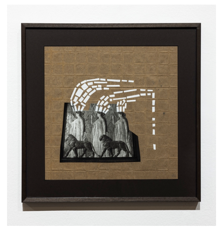
Hera Büyüktaşciyan, Intervals for the Unreplaceable (6). Collage serie, 2022

Büyüktaşcıyan's collage series, Intervals for the Unreplaceable , combines photographs of architectural fragments and imprints of modernist tiles from Prague. The indented surface of the cast paper reveals the imprinted absence of the tiles, while simultaneously embodying the city's colonial past. In these compositions, the dynamics between ornament/power, departure/ distance and scale/ representation are explored through vocalized contours, flowing between bodies and spaces.