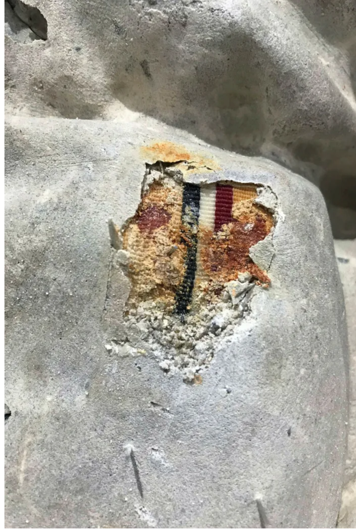
In-progress details of Michael Rakowitz's sculpture \dots