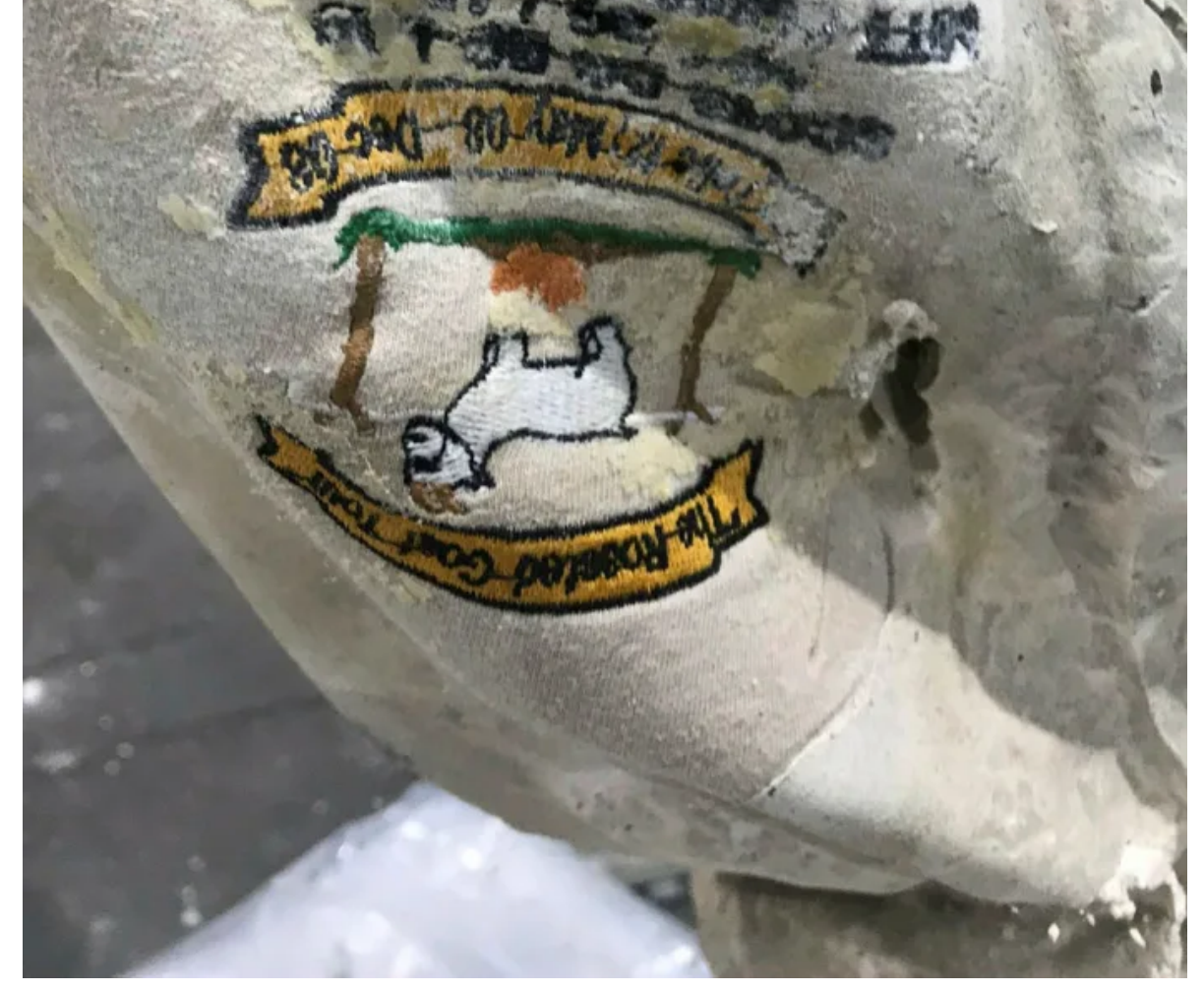
'April is the Cruellest Month', to be shown in Margate

But Rakowitz's project is also local, relating to histories and ambiguities in Margate's site. "Poets and rescuers looking out at the sea for inspiration and life", as well as "the fossil-bearing rock of the coast, which reminds me that stone is an archive", and, crucially, "urgency, of understanding what it means to be at the edge of a place, where hospitality and hostility mix", all inform the piece. In particular, "April" is alter ego and provocative companion to "Surfboat Memorial", Margate's 1899 bronze, facing the waves, of a lifeboatman in oilskins, which honours lives lost in a rescue mission. "I saw that figure looking out to sea and felt a betrayal of that sculpture", Rakowitz says. "We are no longer looking out to sea but turning people away."