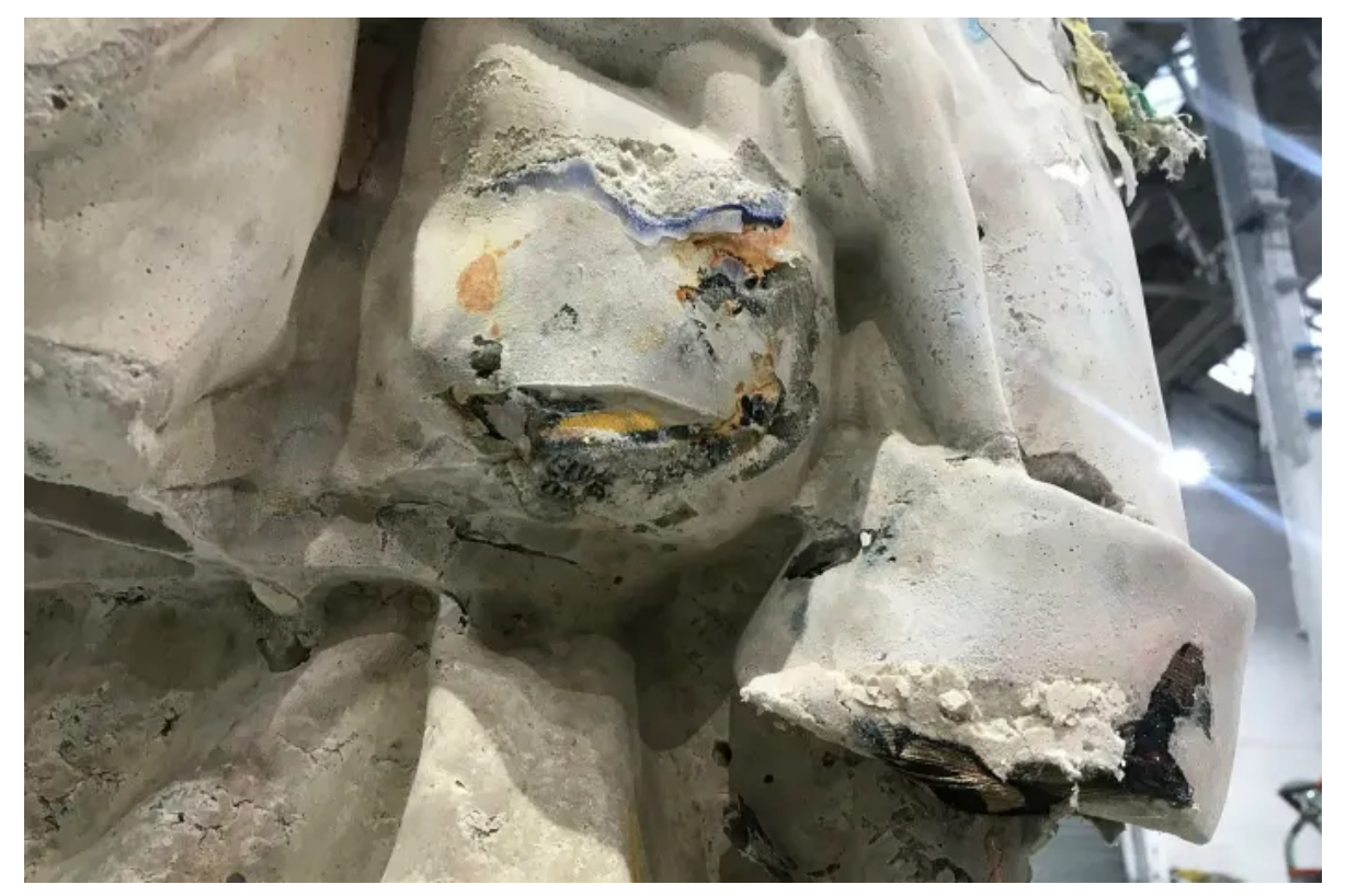
In-progress detail of . . .