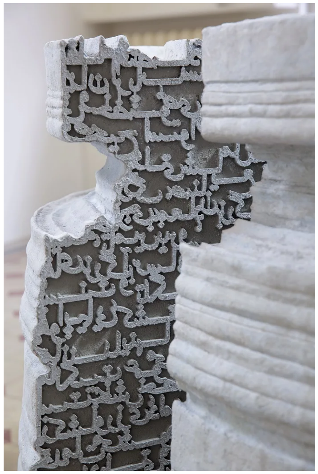
Detail of Nazgol Ansarinia's 'Article 44, Pillars' (2016) and the full sculpture below © Courtesy the artist, Collezione Righi, Bologna, Galleria Raffaella Cortese, Milan, and Green Art Gallery, Dubai