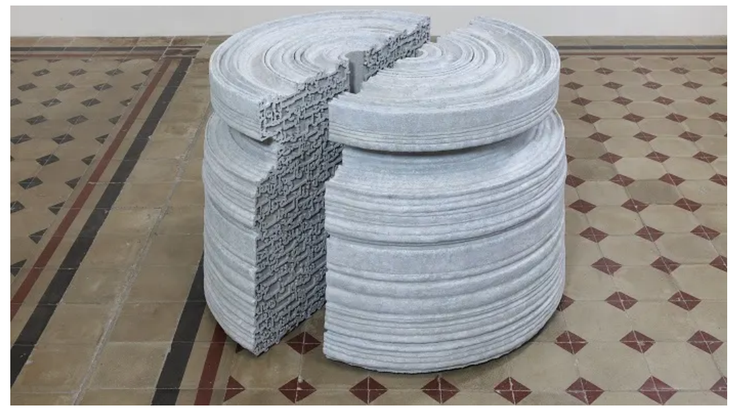
Detail of Nazgol Ansarinia's 'Article 44, Pillars' (2016) and the full sculpture © Collezione Righi, Bologna, Galleria Raffaella Cortese, Milan/Green Art Gallery, Dubai

The Palazzo Pisani boasts in its atrium the three-light lantern that stood at the stern of the galley of Andrea Pisani, admiral of the Venetian fleet. It has airy arcades, a huge ballroom and open courtyards where the final scenes of the 2006 Bond movie Casino Royale were filmed. Built by a doge, occupied by Napoleon's viceroy of Italy, used as a barracks in the first world war and now Venice's Conservatory of Music, it is infused with history as layers of conflict versus harmony: a sympathetic backcloth for artists invariably touched by their country's political instability, but also transforming experience of trauma and exile into subtle meditative works.