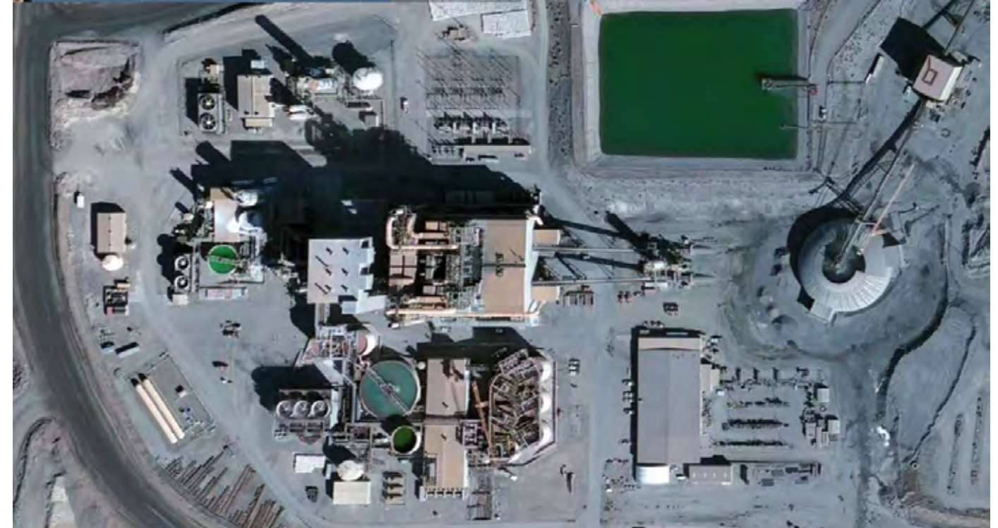
Newmont gold mine outside of Elko, NV.

Despite being part of an opaque supply chain network, open-pit mines are heavily regulated and surveilled. As we look out onto the future ancient ruined city of the open pit, our tour guide explains that a network of prisms and sensors monitor the pit at all times, helping the company predict and prevent landslides. The entire mining operation is as delicately monitored as the earth they mine. The haul trucks are tracked by management and directed to different extraction sites via software. The refinery site where gold bars are actually poured stands behind a maze of barbed wire, key cards, and surveillance cameras (the inside of the refinery is not on the tour). Employees can't take anything offsite, including "waste rock" materials that would be used for building berms (technically, this just means anything from the earth that isn't gold, so other minerals like silver and copper are forms of waste rock). Refinery workers have to shower before and after their workday, though this is more likely due to chemical exposure risks than fear of theft.