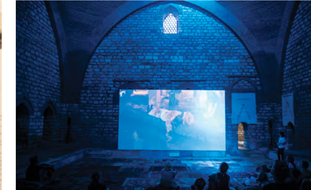
Wael Shawky, Cabaret Crusades: The Secret of Karbala, 2015. Installation with projection in HD video, liquid tar, clay cement, wool, marble, and hand blown Murano glass marionettes.