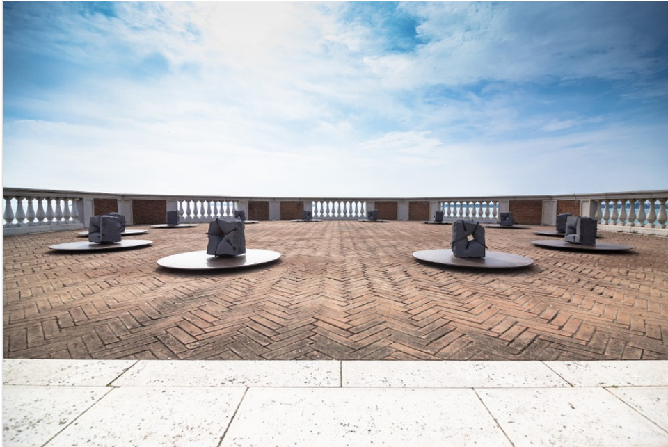
Mikayel Ohanjanyan, Tasnerku , 2015. Mixed size basalt blocks and discs of corten steel, 120 cm each disc. Installation view, Mekhitarist Monastery of San Lazzaro degli Armeni, Venice. Courtesy the artist and Tornabuoni Arte Gallery, Florence. © Piero Demo.

a kind of border thinking as mediators: a perspective Walter D. Mignolo describes as 'thinking in exteriority in the spaces and time that the self-narrative of modernity invented as its outside to legitimize its own logic of coloniality.' [27] For the artists of Armenity , who are positioned at once 'inside' and 'out', the body is both the compass and the map, and the artwork a mediator through which blended histories are channeled so as to navigate a world on edge, in which change is the constant, and it is always possible.