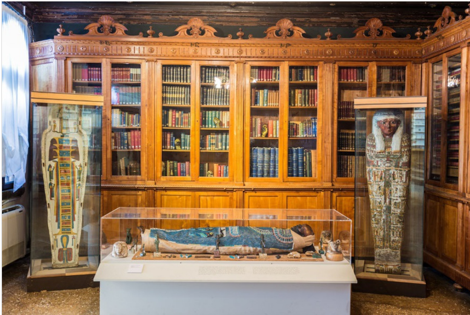
Hera Büyükaşçıyan, The Keepers , 2015. 12 casted hands in wax and bronze, 19 x 9 cm. Installation view, Mekhitarist Monastery of San Lazzaro degli Armeni, Venice.

Ultimately, when faced with the ever-lengthening scroll of human history as represented in such world spaces as the Venice Biennale, it is down to the individual to take what they can from what they see and understand. After all, as Paul Crowther noted in Art and Embodiment , 'the structure of embodied subjectivity and of the world are directly correlated.' [9] Thus, when entering spaces like these, you might say we all become global wanderers, as we move from webpage to webpage, or from national pavilion to collateral event. We become bodies that exist between frames, like those of the displaced: bodies that relate to the world – and to each other – through personal experience first and foremost.