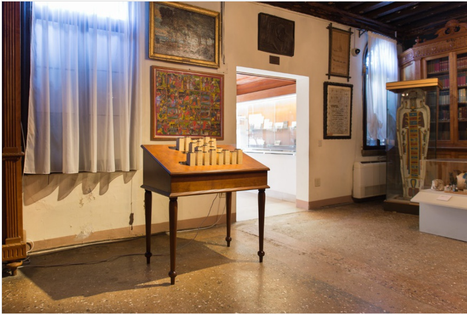
Hera Büyüктаşçıyan, Letters from Lost Paradise , 2015. Mechanism, bronze, wood. 64 x 100 x 85-90 cm (front), 110-115 cm (back). Installation view, Mekhitarist Monastery of San Lazzaro degli Armeni, Venice.

India, between 1794 and 1796, while another, Taregrutian (The Chronicle) , was launched in 1799 right here on the island of San Lazzaro, printed by the Mekhitarian monks in the modern Western Armenian language, Ashkhararabar. Indeed, by the beginning of the nineteenth century, Marc Grigorian notes, 'Armenian communities as far apart as Bombay and Calcutta in India, Astrakhan in Russia, Vienna in Austria, and Constantinople and Smyrna in the Ottoman Empire, were all enjoying the opportunity to read locally produced newspapers in their native Armenian language.' [20]