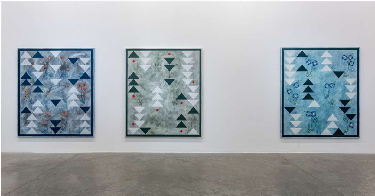
Installation view of KAMROOZ ARAM 's exhibition "Recollections for a Room" at Green Art Gallery, Dubai, 2016.

Existing apart from the sculptural installations, Aram's paintings serve as a point of entry into mapping out coordinates of time and space by showcasing the entire process through continued erasure and redrawing. The "Ornamental Composition for Social Space" series (2016) expands on his earlier "Palimpsest" paintings, repeating an isolated detail from Persian carpets he photographed in New York City. He begins with a pencil grid, using this as a guide for floral forms he traces in oil crayons, and then wipes away the existing illustrations with solvent and rags. After excavating pre-existing patterns, he draws over the blurred remaining forms with new geometrical shapes and floral motifs, while exposing the pencil grids to the surface during the production process.