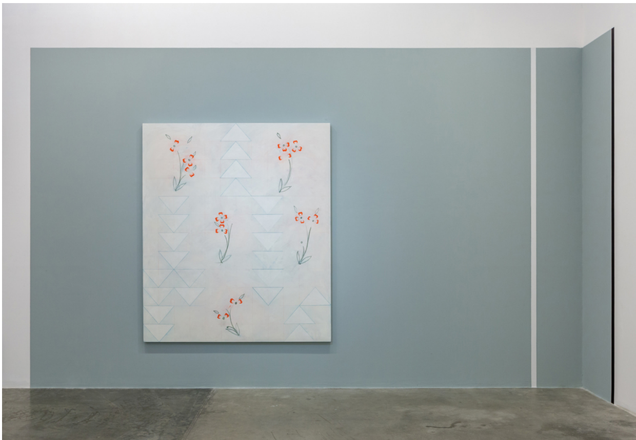
Installation view of KAMROOZ ARAM 's Ornament for a Quiet Room (2016) for the exhibition "Recollections for a Room" at Green Art Gallery, Dubai, 2016.