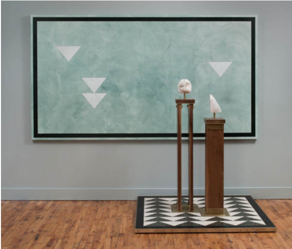
KAMROOZ ARAM, A Monument for Living in Defeat , 2016, canvas: oil, wax and pencil on canvas, 152.4 × 274.3 cm; tile platform: terrazzo and brass on panel, 137.2 × 122 × 5 cm; pedestals: solid walnut and brass pedestals, 122 × 20.3 × 20.3, 104 × 20.3 × 20.3 cm; sculptures: soapstone and alabaster, 17.8 × 16.5 × 15.2, 20.3 × 10.2 × 15.2 cm. Courtesy the artist and Green Art Gallery, Dubai.

Since preparing for his exhibition commissioned by the Abraaj Group Art Prize, “Ancient Through Modern: A Collection of Uncertain Objects, Part 1” (2014), Aram has focused on the presentation of objects in a mid-century exhibition catalogue titled 7000 Years of Iranian Art (1964) published by the Smithsonian Institution. He paid careful attention to the way these objects were photographed before bright blue or red backdrops; in other cases, they appeared in dramatically lit black and white photographs. These images inspired him to envision the museum as a site for cultural nostalgia, serving as a site for Iranians to commemorate their glorious history. Aram’s works address a failure to live in the present—some dwell in the past, defining themselves via borrowed grandeur of another age. This is accomplished by appropriating pictorial motifs that signify specific eras; Aram acknowledges these elements as a flawed representation that stagnates artistic evolution.