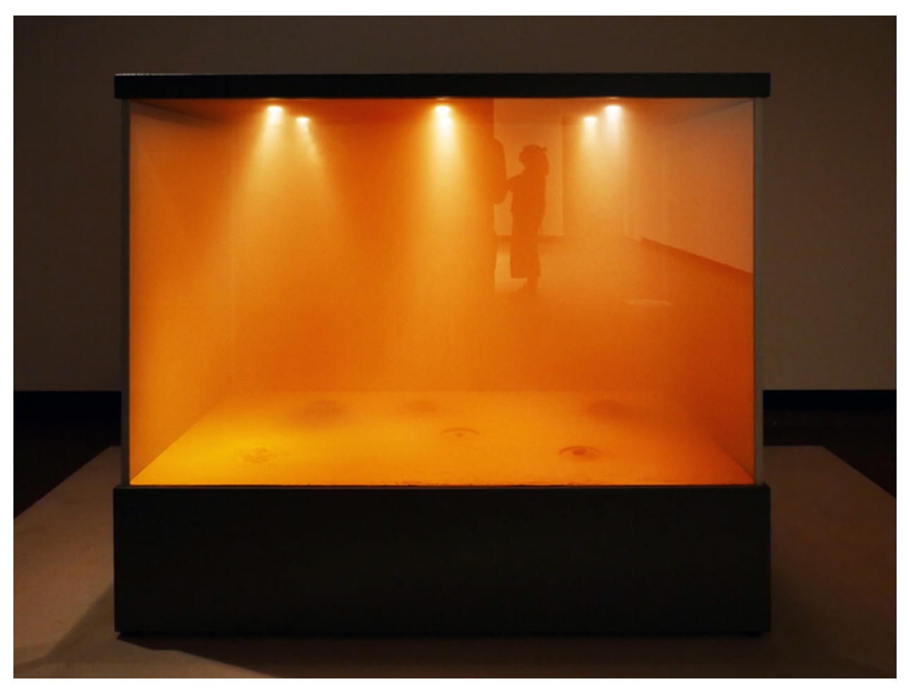
Installation view of DORA BUDOR 's Origin II (Burning of the Houses) , 2019, custom environmental chamber, 152 \times 160 \times 86 cm.

"The Seventh Continent" is laid out as an essayistic narrative, along an intended path—a tediously prescriptive feature of several recent mega-exhibitions, including this year's Aichi Triennale. The first work one encountered at the Istanbul Museum of Painting and Sculpture was Dora Budor's three chambers of glowing lights and dust, activated by sound sensors from the construction project nearby ("homeorhetic systems"); the sound frequencies become a score that turns the "dust chambers" to shades evocative of J.M.W. Turner's dramatic seascapes and landscapes, which captured atmospheric pollution centuries ago. The next installation, Eloise Hawser's The Tipping Hall (2019), comprises videos of a recycling plant, and metal objects reconstituted from the waste-management facility. New large works from Deniz Aktaş's series of ink