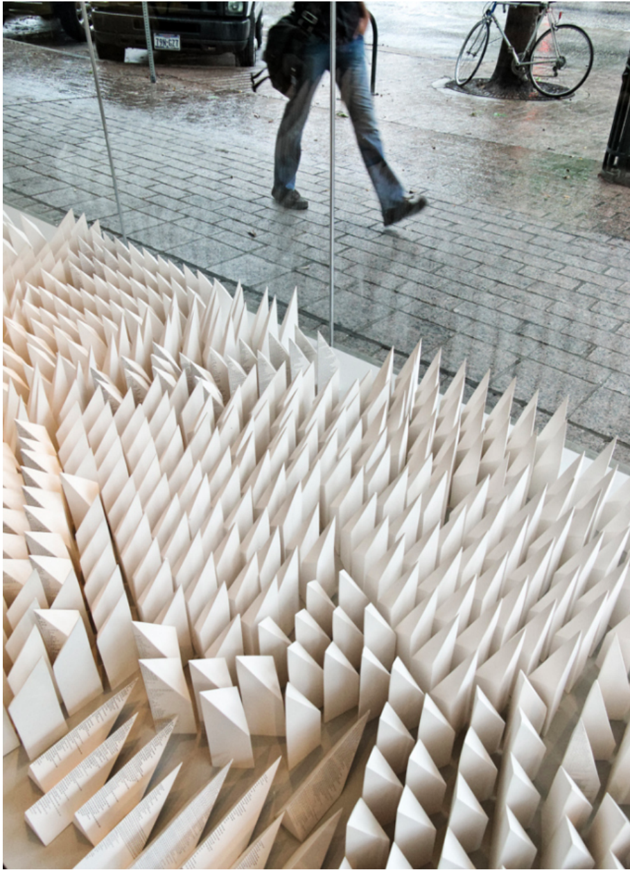
Seher Shah, Detail of Object Repetition (Line to Distance), 2013.

For the first time, these new works are shown alongside her earlier drawings that reference the 1903 British coronation ceremony held in India, known as the Delhi Durbar. Here Shah combines archival imagery of the grand event with hand drawn and digital elements, to explore the multi spacial tangents of the ceremony. A work from this series titled Perversions of Empire: Cluster was part of Saffronart's autumn auction of Modern and Contemporary South Asian Art in September 2013.