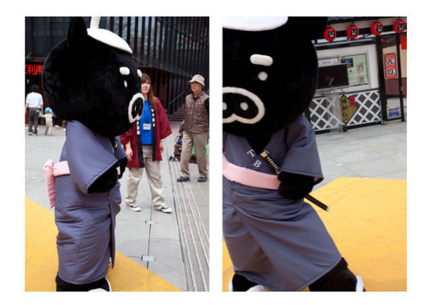
WassinkLundgren Tokyo Tokyo - Akasaka no. 9, Tokyo, Japan , 2010 mariondecannière