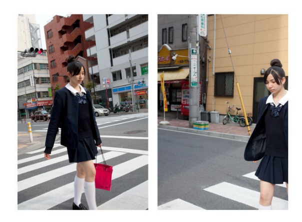
WassinkLundgren Tokyo Tokyo - Ueno, no. 22, Tokyo, Japan , 2010 mariondecannière