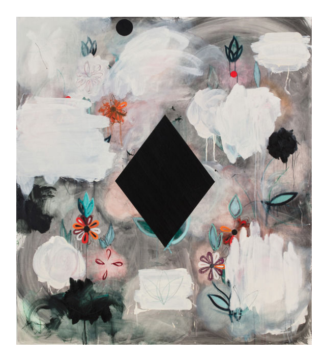
Kamrooz Aram Year One (Palimpsest #17),, , 152 x 137 cm, 2013 Green Art Gallery